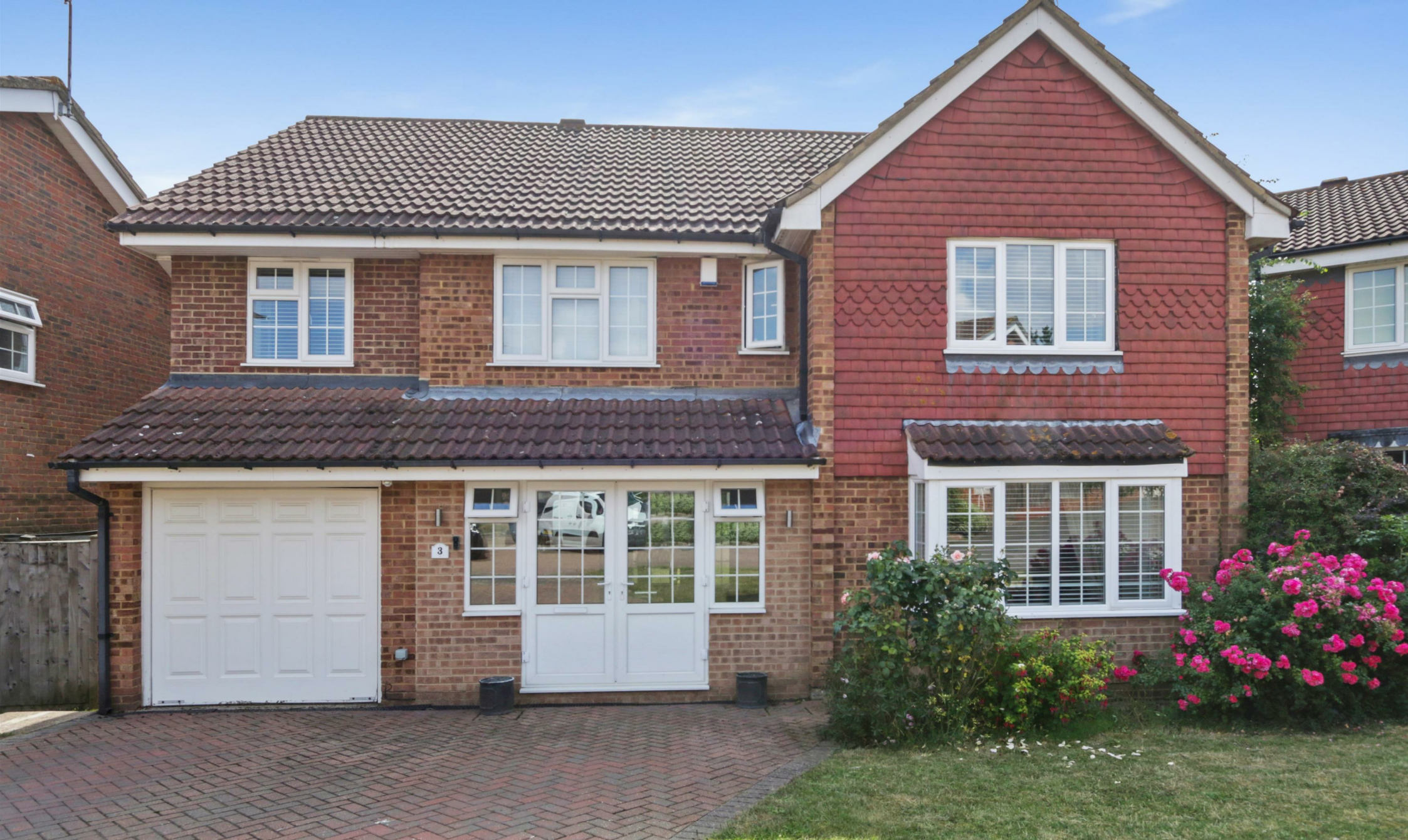
3 Stewart Close Chislehurst, Kent BR7 6TE £4,300 Per month